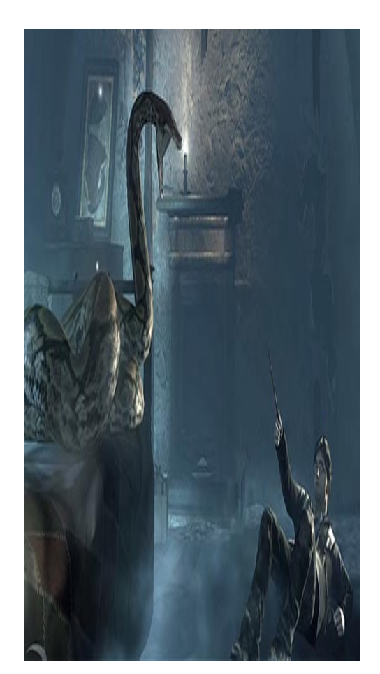
Nagini, Voldemort's pet snake, is introduced in the first chapter of Goblet of Fire and is described as a long green serpent. As with his diary, Voldemort intended Nagini to be a tool as well as a safeguard to his immortality

Speaking to snakes -- Called Parselmouth in Chamber of Secrets -- p. 195. Certain Black Magick practitioners, very powerful and "gifted", do talk to snakes. Communicating with snakes is 'the mark of a Dark wizard'. [p. 199]